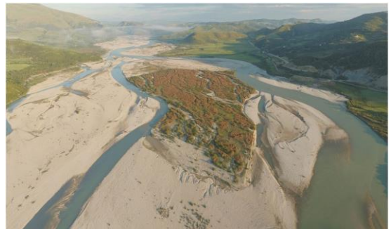
This is how a wild river looks like: the Vjosa in Albania.