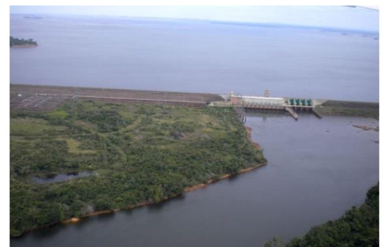
Hydropower is outdated. When will the World Bank finally internalize the global shift towards wind and solar?

Hydropower is a phase-out model. Wind and solar – environmentally, socially as well as economically much sounder – are the energy sources of the present and future. Why is then, that the World Bank seems to ignore the global shift in the renewable energy sector and instead continues to advocate for multi-billion dollar dam projects? MORE