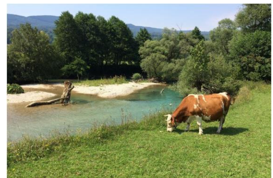
Sana in BiH. A total of 93 HPPs are planned within Huchen stretches in the Balkans. This would lead to a population decline of 70%.

The Ministry of Environment of Bosnia-Herzegovina denied the licence for the construction of a hydropower plant on the Sana – one of the most valuable Huchen rivers in Europe. This project was planned downstream of the HPP construction site “Medna” and would have destroyed a precious Huchen stretch. By the way: we are in the process of making the rivers of Bosnia-Herzegovina to a further key area in our campaign.