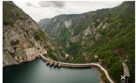
More and more states worldwide are reconsidering their hydropower strategy

An article by the Circle of Blue indicates the end of the hydro era. "A lengthening list of nations around the world [...] are reassessing big hydropower dams in an era when wind and solar power are less expensive, much easier to build, less damaging, and far less vulnerable to droughts and floods," the article states. Read for yourself!