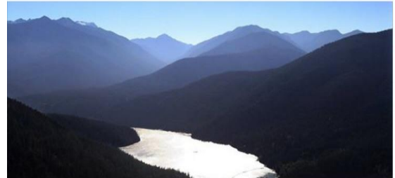
Hydropower isn't carbon neutral after all, WSU researchers say

Hydropower is not green, it is not even carbon neutral, as Washington State University researchers now confirm. In their study , scientists confirm that reservoirs are notable sources of the potent greenhouse-gas methane. This report will hopefully be another step in the phasing out of this greenwashed technology. MORE