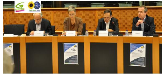
Blaues Herz in Brüssel Die Balkanflüsse verdienen gemeinsamen Schutz. In Brüssel der Europäer „Blau Herz Center“ werden Energie und Umwelt

In cooperation with MEP Ulrike Lunacek (Vice president of the EU Parliament, Greens / EFA Group), we brought together different stakeholder in Brussel in late June – NGOs, energy supply companies, financial institutions as well as representatives from the EU Parliament and Commission. Ulrike Lunacek voiced her concern about dam projects on the Vjosa.