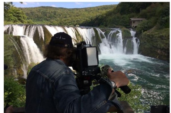
Filming at the Una in Bosnia-Herzegovina

On the occasion of the World Rivers Day, the ZDF aired a documentary about the Balkan Rivers and the dam craze that puts them at risk. This episode of the “planet e” series depicts the beauty of these rivers as well as the opposition against the imminent river regulations and damming. The documentary was mainly filmed in the Balkans, but also in Vienna and North Rhine-Westphalia, and provides a good insight into our work. Watch here